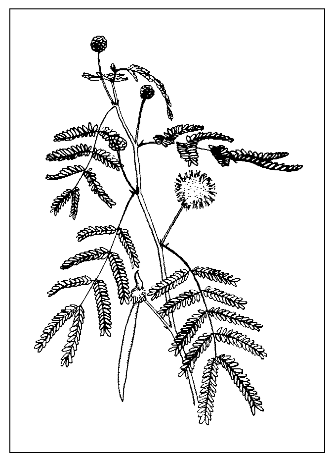
Figure 3. Foliage of Sweet Acacia.